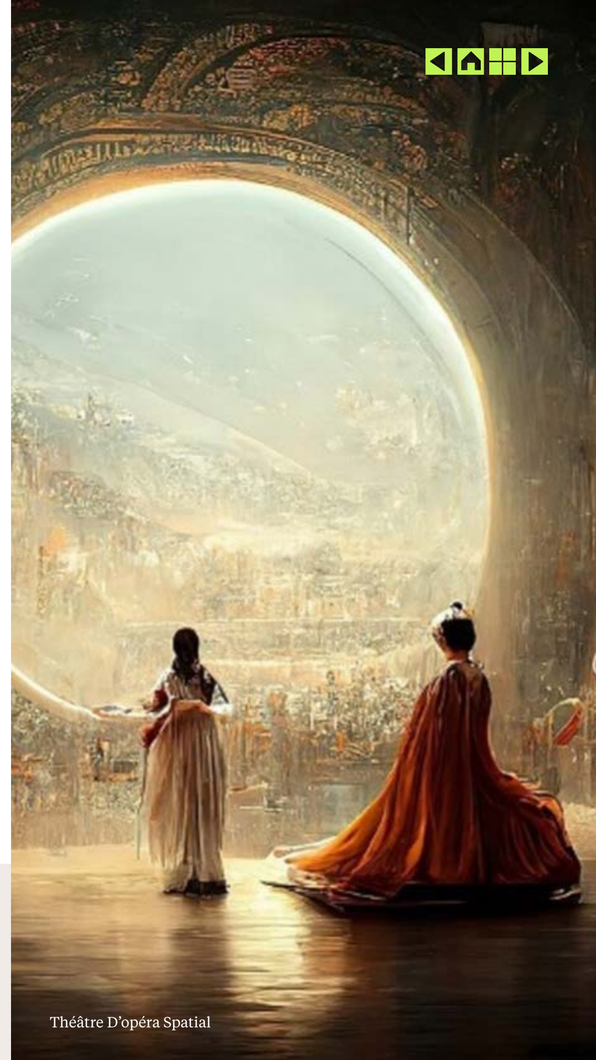
Théâtre D’opéra Spatial